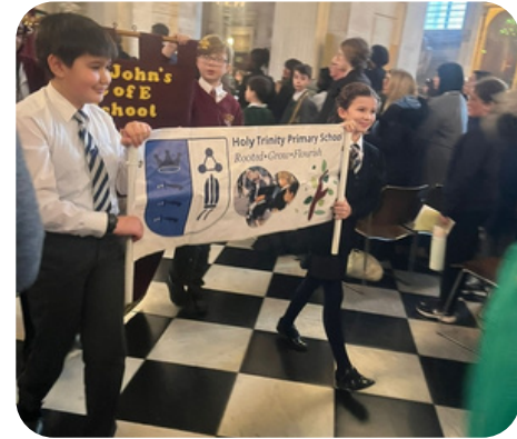
Flying our flag at St Paul's Cathedral!