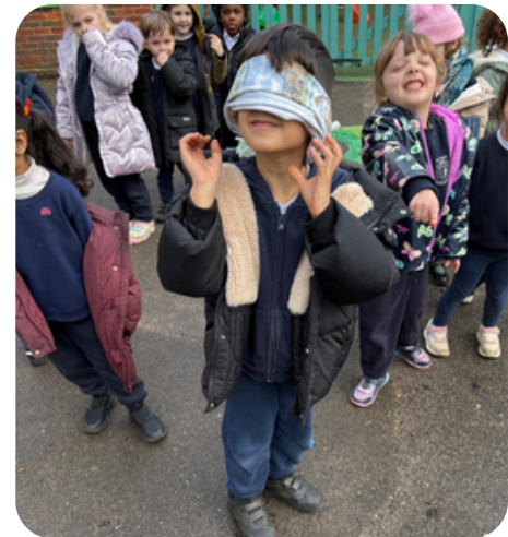
Trusting our friends directions in Reception!