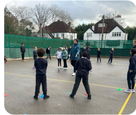
Year 5 working with Brentford FC

It has been a wonderfully busy time across our school community! I'm delighted to share that our Year 5 pupils have been taking part in Brentford FC's Joy of Movement programme this term. Through a series of dynamic and engaging sessions, the children will be developing their confidence, coordination, and enthusiasm for physical activity. It's been fantastic to see them bringing such energy, joy, and teamwork to the first session - a huge thank you to the Brentford FC coaches for their superb support.