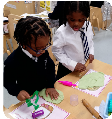
Learning about Lent and Easter is underway across the school!

A final, fun reminder - we are celebrating World Book Day across the partnership next Friday, 6th March! Pupils and staff are already buzzing with excitement about the costumes, characters, and creativity that will fill our corridors. We can't wait to see all the amazing outfits and to share in the joy of reading together.